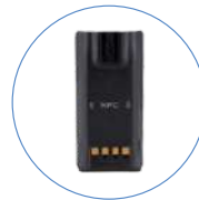
4,000 mAh Li-Poly Battery BP4005