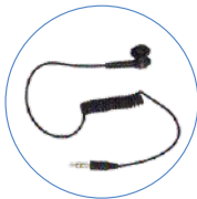
Receive-only Earbud ES-01