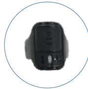
Wireless PTT POA121