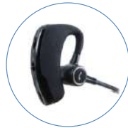
BT Earpiece EHW08