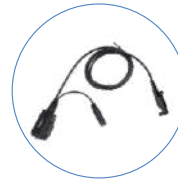
PTT&MIC Controller ACN-02P