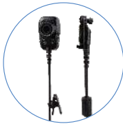
USB Camera VM220-N1