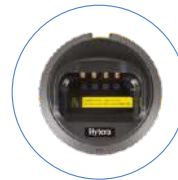
Charger (2A) CH20L13