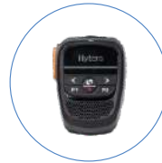
Wireless Remote Speaker Microphone SM27W2