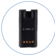
2,400 mAh Li-Poly Battery BP2402