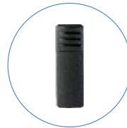
Belt Clip BC39