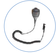
Water-proof Remote Speaker Microphone SM26N1-P